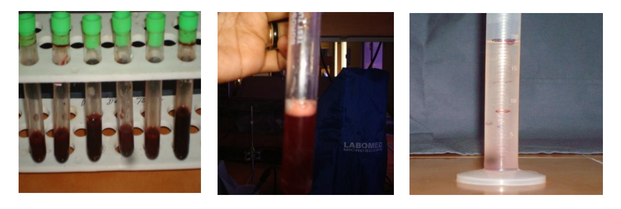
Fig 1. Blood samples collected Fig 2. Erythrocyte sedimentation rate Fig 3. Catalase activity test

Catalase activity test (Fig 3): sample is smeared on a microscope slide and a drop of hydrogen peroxide is placed on the smear. Copious bubbles liberated in the hydrogen peroxide, indicates presence of catalase.