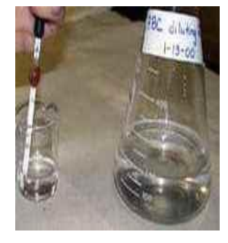
Fig 7 and 8. WBC and RBC estimation using heamocytometer

In Situ Hybridisation [11] is done to localize amyloid- \beta protein using radiolabelled probes, complementary to its mRNA [12] sequence and quantified using flurescent spectroscopy. The hybridization solution contains dextran sulphate to reduce amount of hydrating water for dissolving nucleotides, formamide and dithiothreitol to reduce thermal stability of bonds, NaCl and sodium citrate to decrease electrostatic attraction between two strands, EDTA to remove free divalent cations from the solution, ssDNA, tRNA, polyA and denhard's solution.