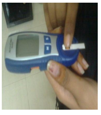
Fig 5. Cholesterol estimation